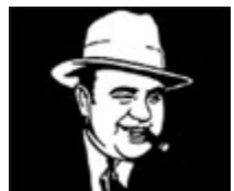
... and the Beast