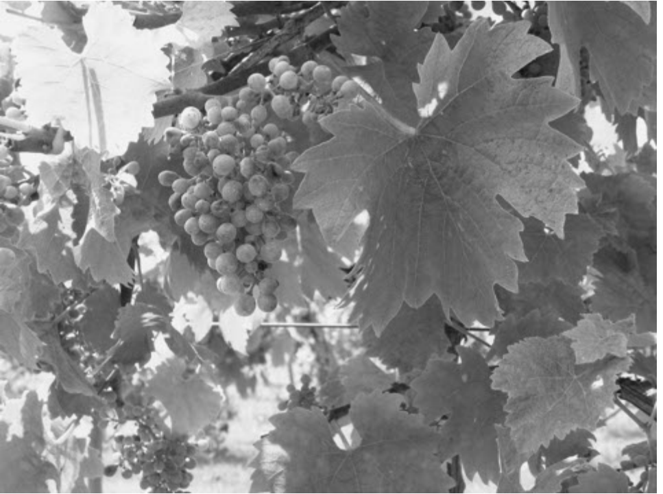
From Vine to Wine, The Pear Tree at Purton