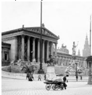
Austria's Parliament on part of Vienna's Ringstrasse

Zones and Sewers - The Habsburgs: Gone but not Forgotten