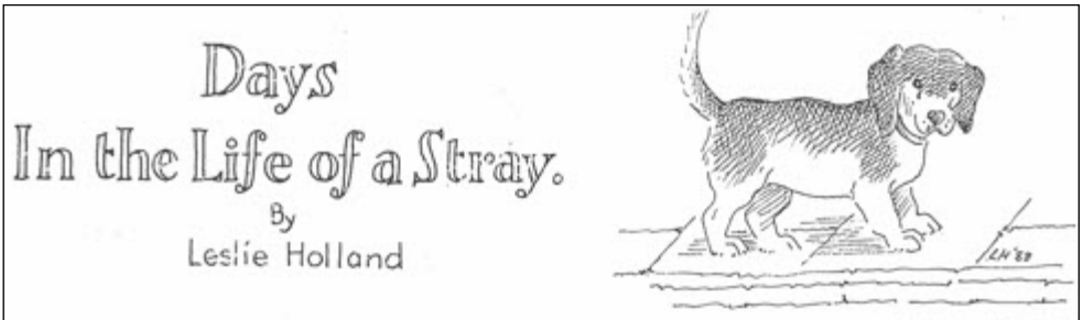
Exhibit of the Month: Days in the Life of a Stray