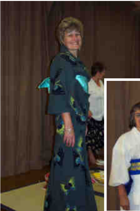
The ladies in kimonos